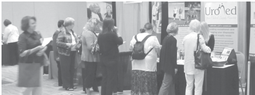
FSARN Conference attendees visiting the vendors